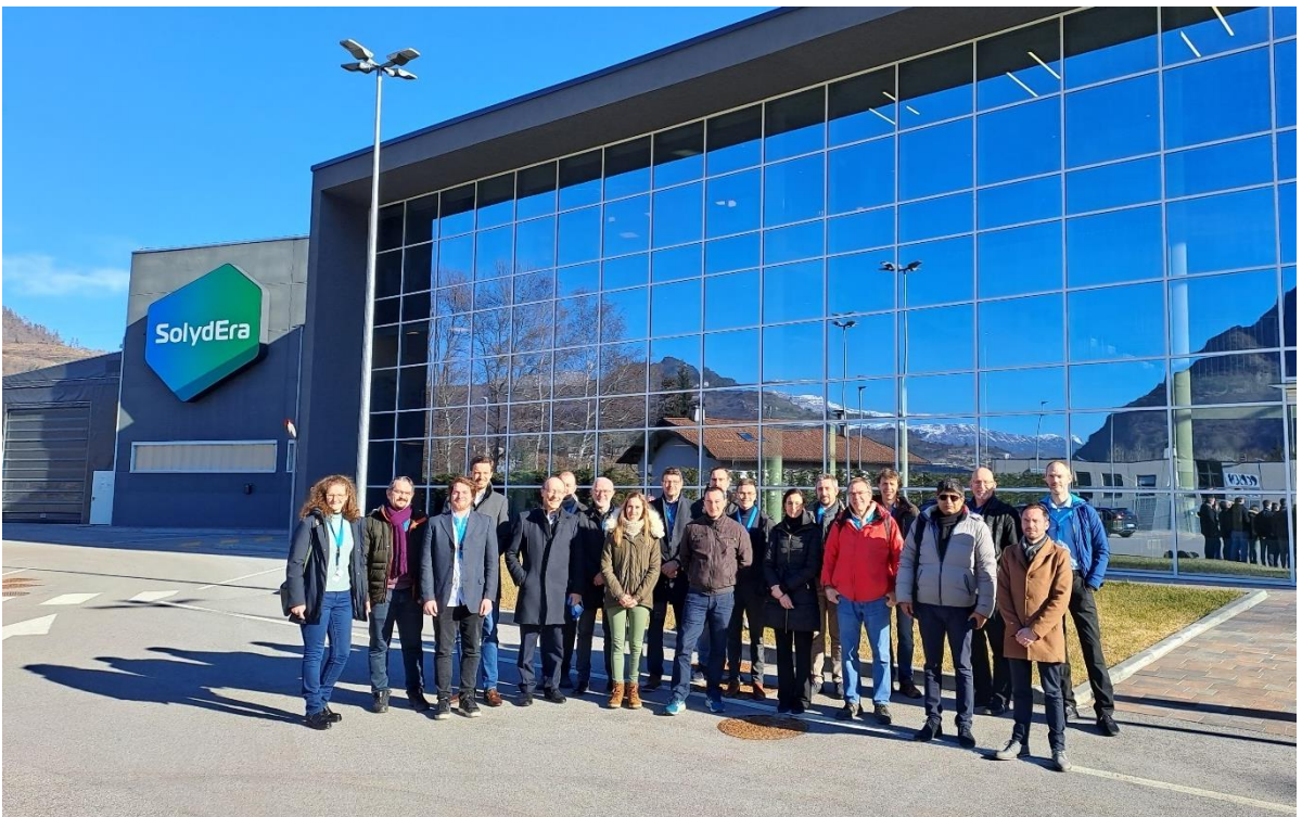
Fig. 3 – Representatives of AMON Consortium during the visit at SolydEra

Contacts of the Coordinator: Luigi Crema crema@fbk.eu Centre for Sustainable Energy | FBK