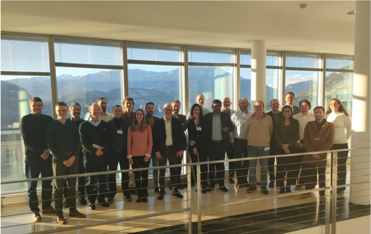
Fig. 2 – Representatives of AMON Consortium at Fondazione Bruno Kessler